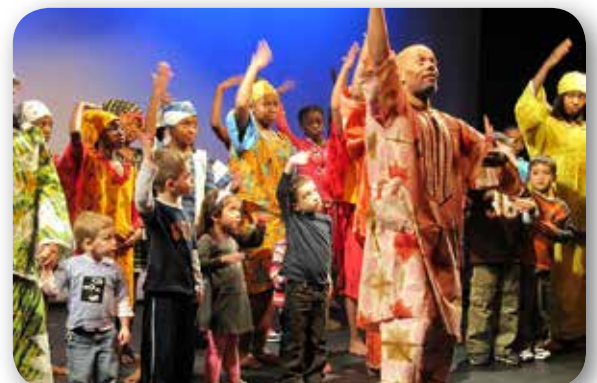
Long Island Children’s Museum >

Passes may be checked out for a total of three (3) days. If the Library is closed on the scheduled date of return, passes will be due on the first day of re-opening. Further details are available on the Library website.